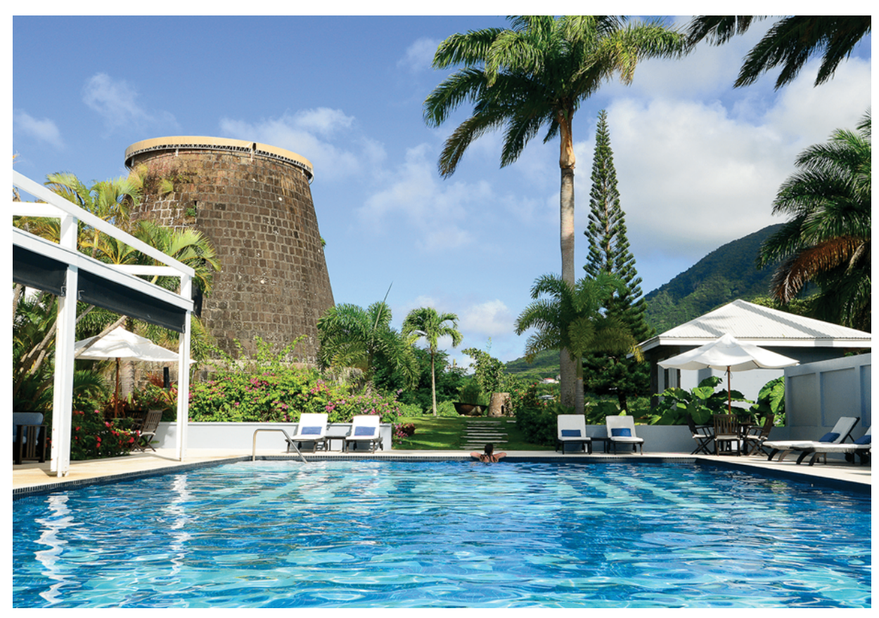
Montpelier Plantation & Beach used to be an old sugar mill.