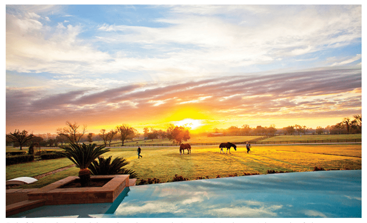
Each of the nine Spanish-style haciendas and casitas at the Inn at Dos Brisas have an indoor-outdoor feel.