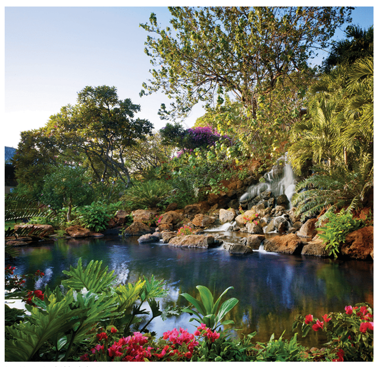
Lanai is a quiet, laid-back destination.