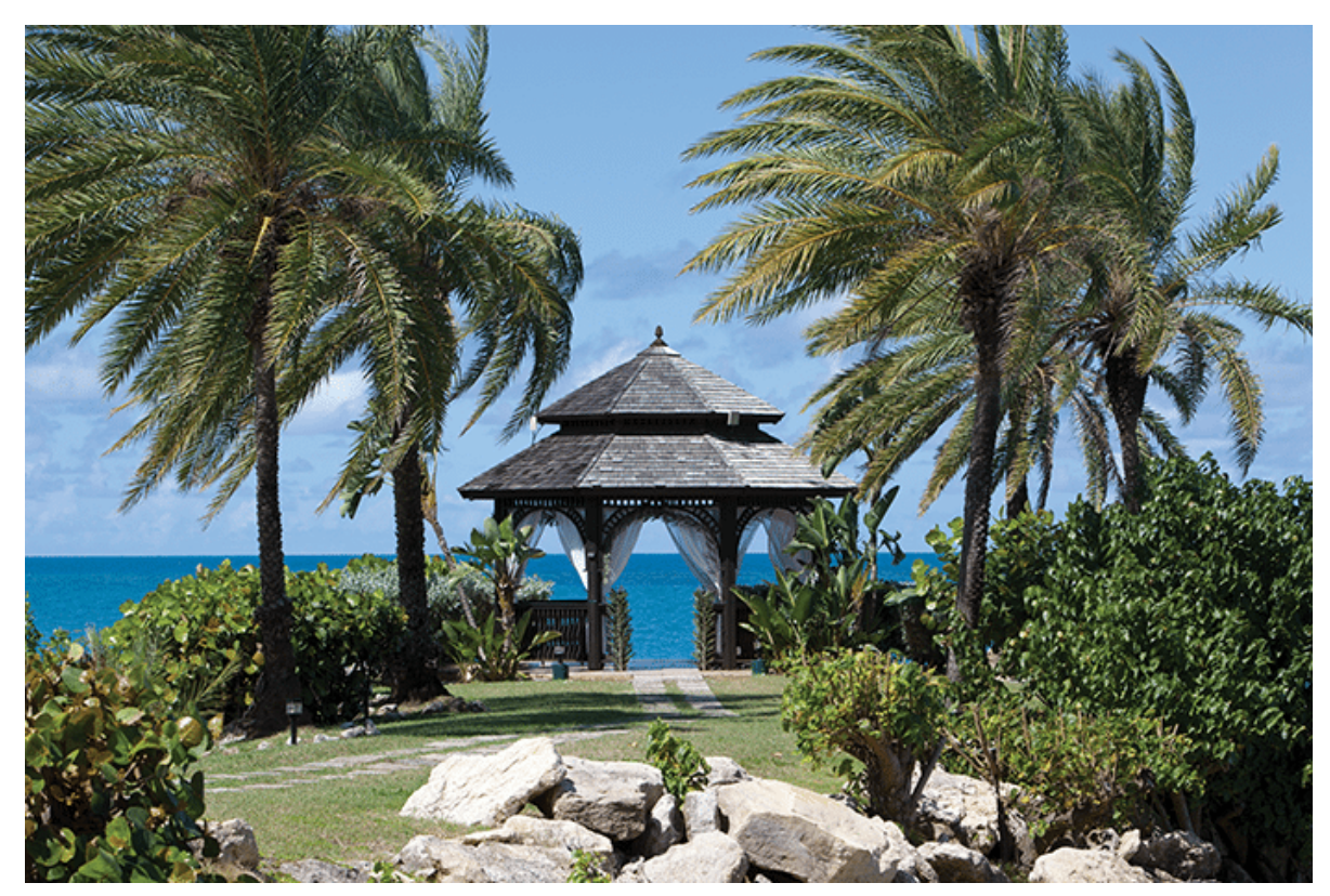
The wedding gazebo at Blue Waters Resort & Spa