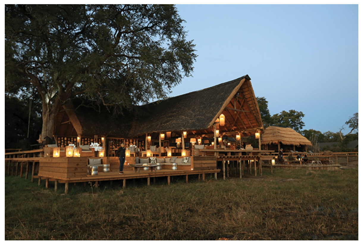
The Sable Allev resort in Botswana