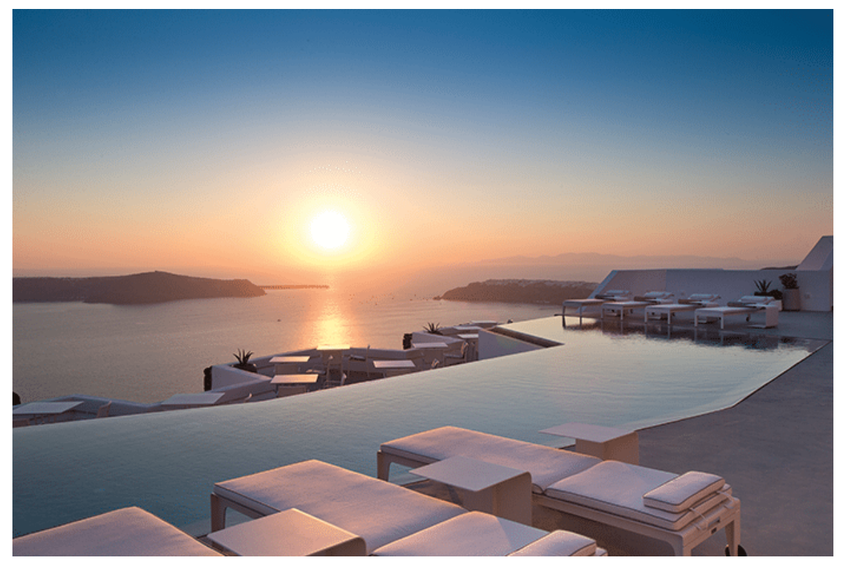
The infinity pool at Grace Santorini