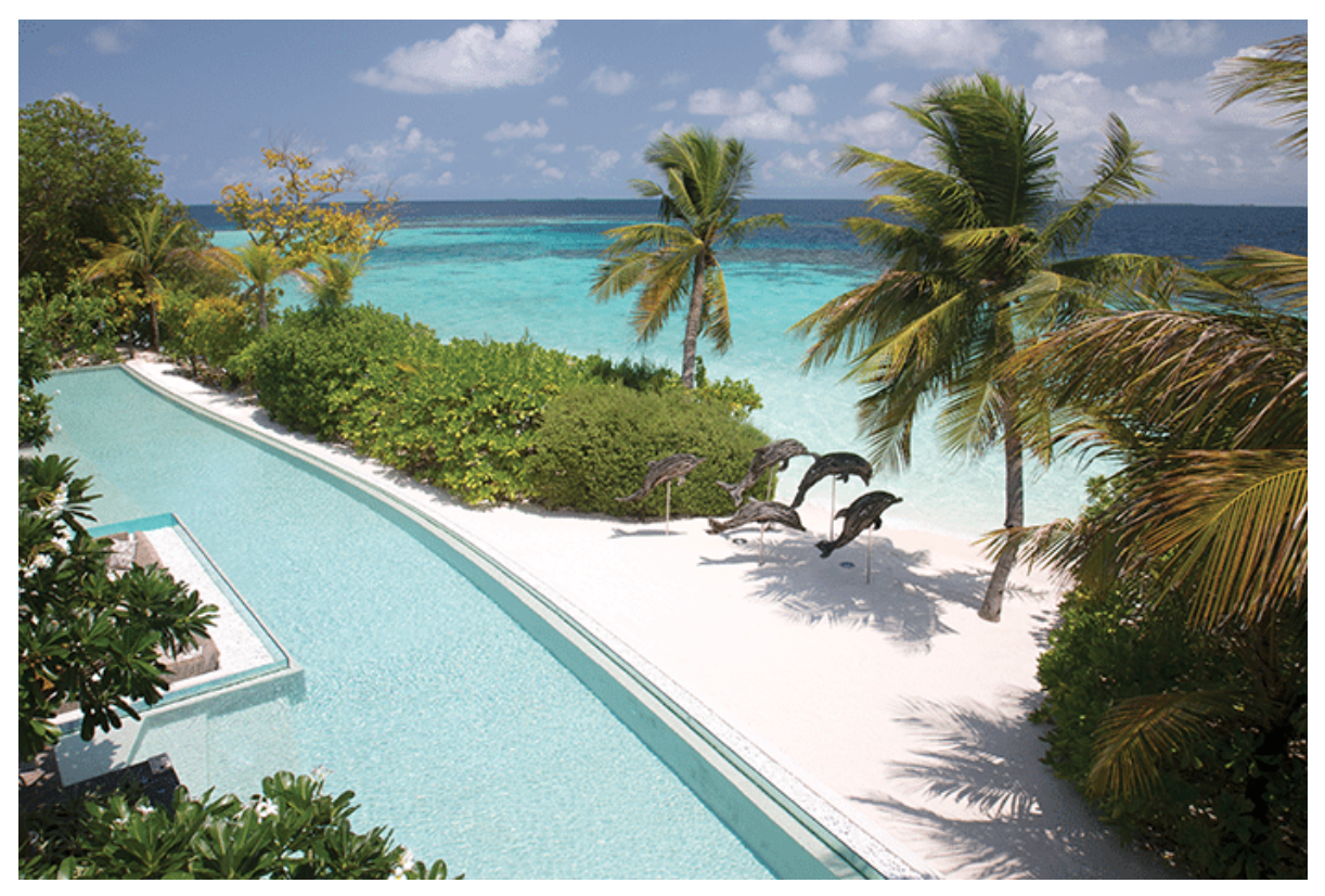
The pool and expansive Indian Ocean at Coco Privé Private Island